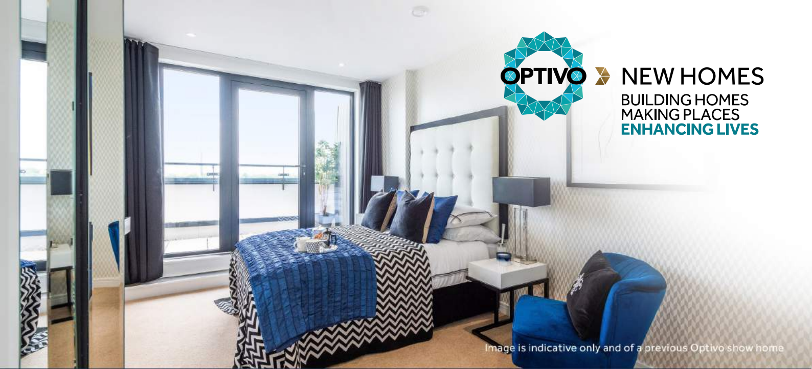
Image is indicative only and of a previous Optivo show home

NEW HOMES BUILDING HOMES MAKING PLACES ENHANCING LIVES